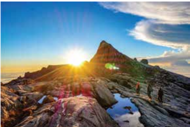
Sunrise above the rocky terrain of Malaysian Borneo's Mount Kinabalu on the hike down from Low's Peak.