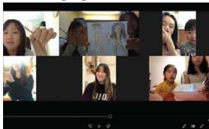
Zoom Biblical Activity