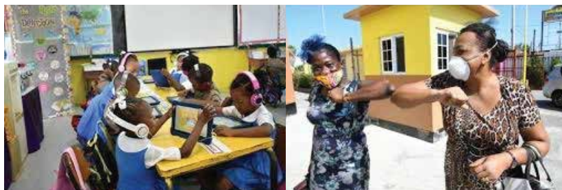
Technology in School