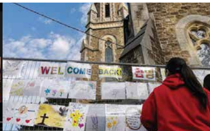
Displaying Kids' work in front of Church Fence