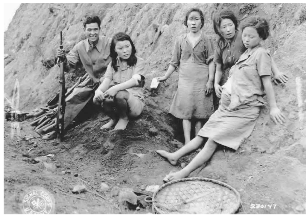
Four Korean comfort women after they were liberated by US-China Allied Forces outside Songshan, Yunnan Province, China on September 7, 1944. Source: The Hankyoreh website at https://tinyurl.com/y4dddxjn. Photo by Charles H. Hatfield, US 164th Signal Photo Company. Note: The original photo is available in the National Archives Catalog at https://tinyurl.com/yyumu88z.

While those who are in the margins are historically and systemically silenced, those who benefit from various intersections of social privileges such as the privilege of being white or proximity to it, cis-gender male, heterosexual, able-bodied, educated, part of the dominant socio-cultural group and etc., - choose silence when their privilege is made visible. This silence happens when someone makes a racist, xenophobic, homophobic, or ableist remark and they say nothing. This silence happens when the dominant group leaves the emotional or self-reflective work to the minoritised group (Thompson, 2004). This silence not a neutral position. Rather, this silence is violence. The unwillingness and passiveness in staying silent only adds to the oppression as it reinforces a culture that seeks to silence those already oppressed and marginalised. Silence is complicity and submission to subjugating systems and reinforces privileges we benefit from. This silence is problematic. And for this we cry out against the uncomfortable silence.