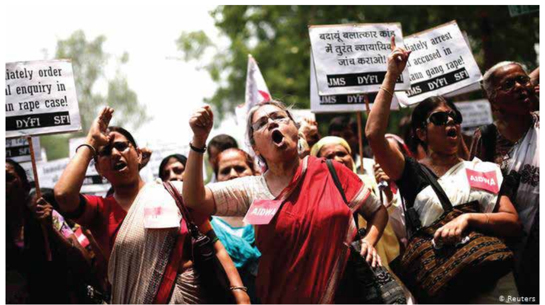
Demonstrators from All India Democratic Women's Association (AIDWA) hold placards and shout slogans during a protest against the recent killings of two teenage girls, in New Delhi May 31, 2014.

If we do not rise.... we are concerned that, particularly, the relentless atrocities on Dalit women and their right to a life of dignity and justice and safety at every stage of their lives will go on unchecked. If we do not rise.... was the challenge we repeated to ourselves, on the 29 of October, a month after the gruesome gang rape and mutilation of the 19-year-old Dalit woman in Hathras in Uttar Pradesh, a state in North India. This Dalit woman from Hathras died in a hospital in Delhi. She was gang raped and brutally attacked by four upper caste men (Thakurs) – in the process they mutilated her body. She died on 29 September, in a hospital in Delhi. An even more outrageous act was to follow - the police did not hand over her body to the family of the girl for her last rites, but instead burnt her body in the middle of the night; thus, not only violating the rights of the family and the girl, but wilfully destroying all evidence. The Dalit feminist movement has reminded us that according to government statistics every single day 10 Dalit women are raped in some part of India.