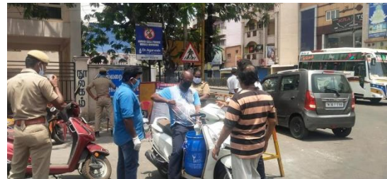
Kanyakumari Diocese- CSI Pastorate Church Keezhkulam celebrating Risen Lord Jesus Christ with the needy in the midst of covid19 April 12/2020 Easter Sunday by providing relief kits